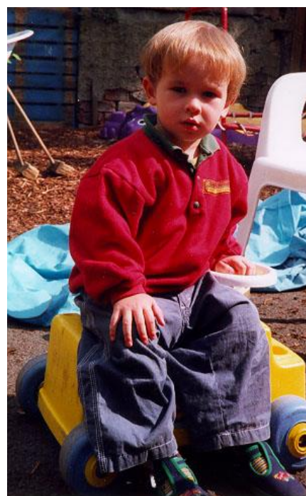
I'll just let the girls sort this out!

Everything we do in the nursery is a learning opportunity for our children and our staff. We continue to monitor the development of both our staff and our children. It is important for our children to have a good mixture of staff led and child led activities. With the better weather, even more time will be spent outside in our garden, picnics or outings such as to the park, the farm, art gallery or museums. There is such a lot to do.