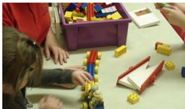
Trains from shapes, maths perhaps?

The Inquirers - Children from 3 years - 4 years, the ante-preschool children, have their own stimulating learning programme and individually designed areas in the nursery. Their daily curriculum may include computing, French,