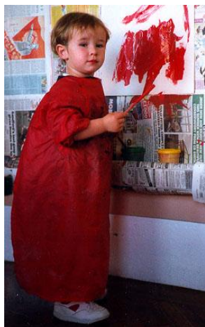
Exploring colour? Just preparing my collection!

Children are mimics and learn fastest from one another. A very positive effect of nursery child care is to improve the social interaction of one child with the other. Equally it is important for their development that they have time with their own age group to develop their own skills.