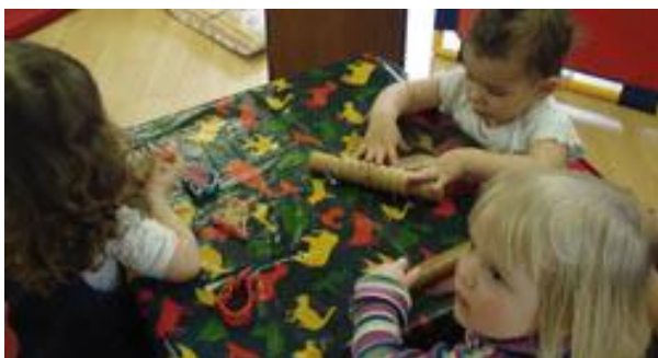
3-D shapes and material science for tiny tots: I can make animals.

'Together we can' has been designed by South Lanarkshire Council in the same format, but age appropriate, as the 'Curriculum for Excellence' and aids the transition from the first to the second at around age three.