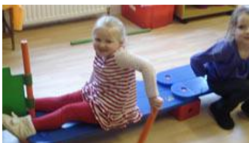
More shapes and Colour. Exhausting work building!

The Adventurers - Children from 2 - 3 years have their own activity and quiet areas. At this stage some Montessori educational materials and other equipment are introduced to provide an enjoyable and adventurous programme. The assessments at this stage concentrate on emotional development along with skills in identifying basic shapes, colour recognition, counting and language development. Outdoor play, visits and visitors will encourage the Adventurers to explore the outside world.