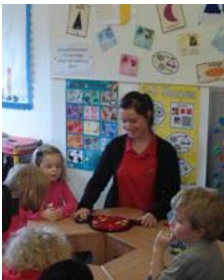
Maths is fun, really!

mathematics and ante-pre-school reading and writing skills. They have their own imaginative play areas, challenging climbing equipment and messy activities areas. The outdoor play facilities are shared with the Analysers.