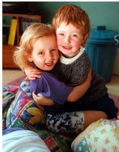
There is always time for a cuddle!

To augment the nursery based activities the children will enjoy external visits to places such as the Glasgow museums to participate in planned early learning and fun workshops or a nature trail and we will welcome into the nursery many of the services such as visits from the police and ambulance personnel. All in all the children will have full, active days learning through play.