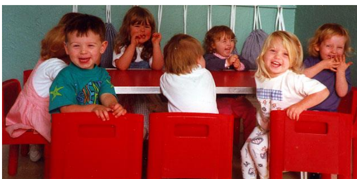
Afternoon tea has arrived, perhaps?

A typical day in nursery care , depending on the particular age group, may include registration and breakfast. A morning session, including free flow snack, may include play in an imaginary hospital, kitchen, dentist, travel agents; art and crafts, French, computing. A home cooked healthy lunch is provided for those in nursery over the lunch period followed by a rest period when the younger children sleep and those who no longer need a sleep engage in quiet activities in order that they can relax before the challenges of the afternoon session.