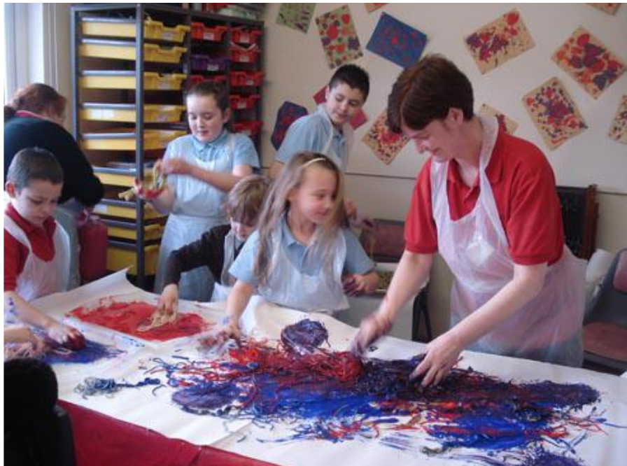
Pasta is not just for eating.

During the October week and Easter and long summer vacation, a Holiday programme is in operation that will appeal to parents requiring full time day care. Our holiday club days are action packed. Children are dropped off at the nursery at Tuphall Road from 7.30 am and we depart by 10 am if we are going on an outing