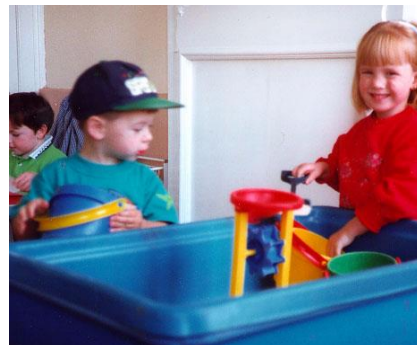
Let's do some research! Explore material science? Add water to sand and what happens?

The Inquirers - Children from 3 years - 4 years, the ante-preschool children, have their own stimulating learning programme and individually designed areas in the nursery. Their daily curriculum may include computing, French,