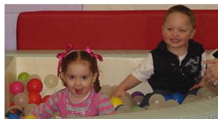
Balls move a bit like water, what fun! Shall we make waves?

pre-birth to three curriculum, to chart the child's progress and to plan for the child's next development steps.