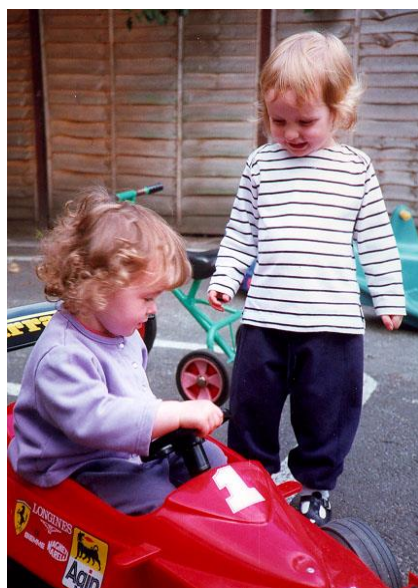
Let's get to the bottom of this! Engineering project perhaps?

Everything we do in the nursery is a learning opportunity for our children and our staff. We continue to monitor the development of both our staff and our children. It is important for our children to have a good mixture of staff led and child led activities. With the better weather, even more time will be spent outside in our garden, picnics or outings such as to the park, the farm, art gallery or museums. There is such a lot to do.