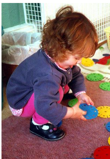
What will I do with this?

The Scottish Government states 'Our aspiration is to enable all children to develop their capacities as confident individuals, effective contributors, responsible citizens and successful learners'. This is embodied in a 'Curriculum for Excellence' and in the pre-birth to three curriculum.